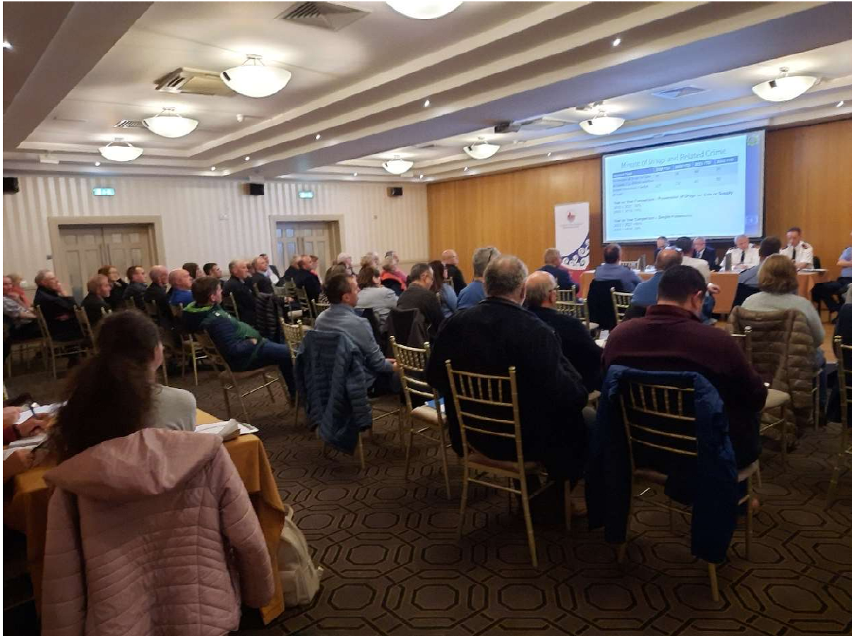
Members of the public attending our Annual JPC Meeting in the Claregalway Hotel on the 14th November 2022