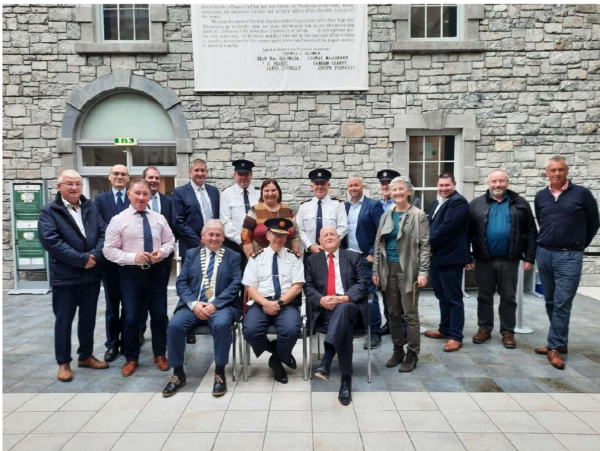
The Garda Commission, Drew Harris, pictured with members of the County Galway Joint Policing Committee in Áras an Chontae

The Garda Commissioner, Drew Harris, attended our September meeting following an invite from the committee, to discuss the new Policing Operating Model and other topics. He received a very warm welcome from the Committee. He detailed the progress that has been made nationally during his time in the role and he also outlined the plans that are in place for the future and what they hope to achieve going forward.